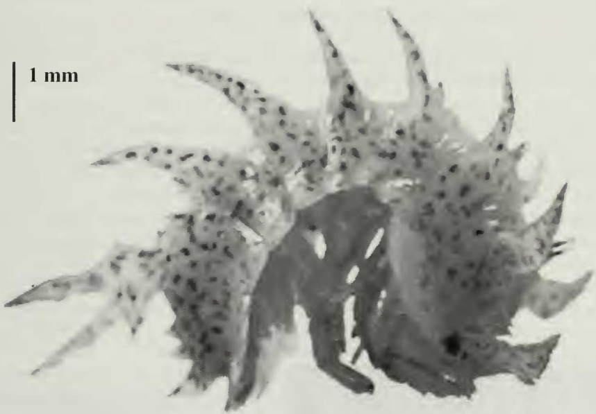
Figure 1. Pseudarmadillo vansicklei n. sp. Lateral view of the body. Male holotype (TL=10,1) Figura 1. Pseudarmadillo vansicklei n. sp. Vista lateral del cuerpo. Macho holotipo (LT=10,1)

tral horny scale in the first half. Tergite VII with two enormous and dissimilar central expansions, upturned and extending far beyond end of the telson (Fig. 2C), ventrally with two strong spines in their base and down turned; small lateral spines followed by two subcentral smaller ones. Peraeonal segment I wide and subrectangular, with an insignificant groove that finishes in an internal process in spine appearance; internal lobe of the peraeonal segment II sharp and notably developed (Fig. 2B).